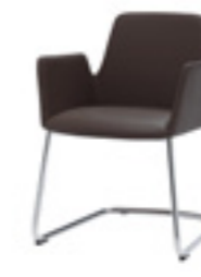
Cantilever base Pie de patin Pietement luge