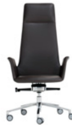
Swivel or tilt aluminium base Base giratoria o basculante de aluminio Giratoire ou basculant avec base aluminium