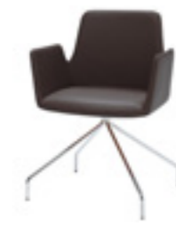
Trestle swivel base Base giratoria piramidal Base giratoire pyramidale