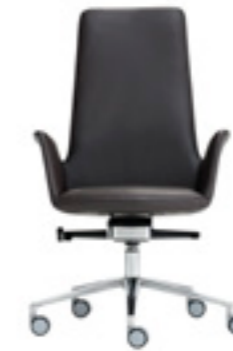
Swivel or tilt aluminium base Base giratoria o basculante de aluminio Giratoire ou basculant avec base aluminium