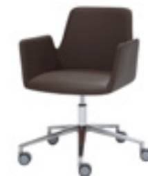
Swivel or tilt aluminium base Base giratoria o basculante de aluminio Giratoire ou basculant avec base aluminium