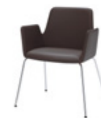
4 tube legs 4 patas de tubo 4 pieds en tube