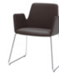
Rod sled base Pie de varilla Pietement en tige d'acier